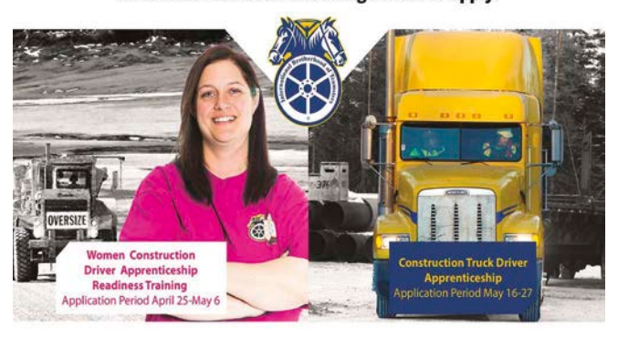
EARN. TRAIN. GET CERTIFIED WITH BENEFITS!

Have family or friends who would benefit from being an Alaska Teamster? Encourage them to apply!