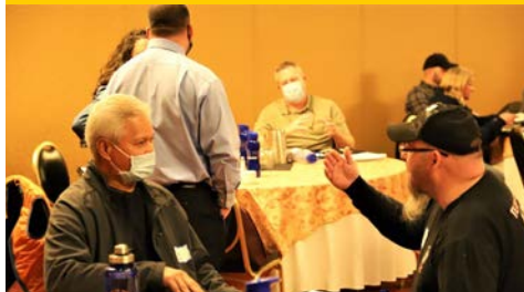
Sharing experiences from their bargaining units