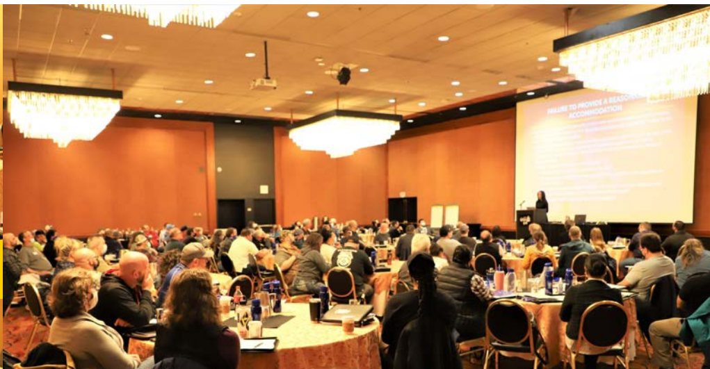
Fall Shop Steward School at the Hotel Captain Cook