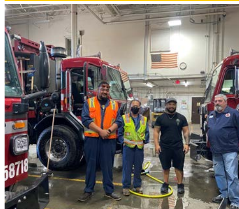
Solid Waste Services