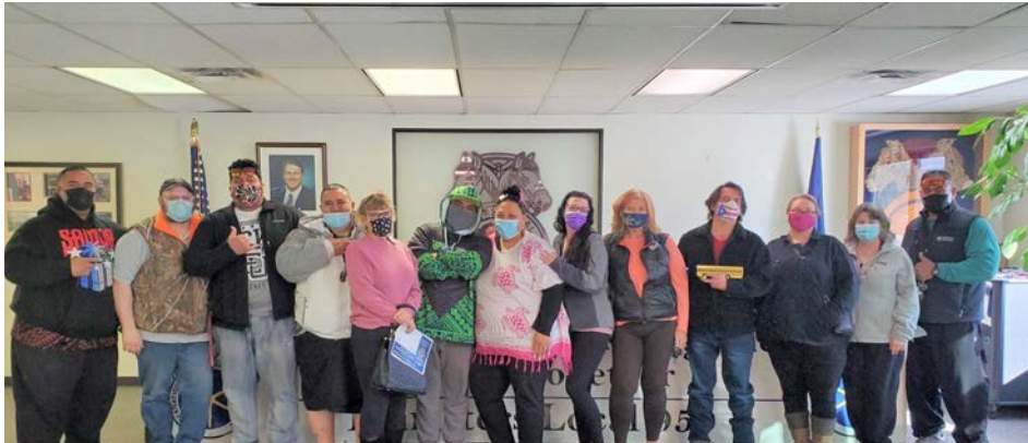
Anchorage School District Bus Drivers & Attendants