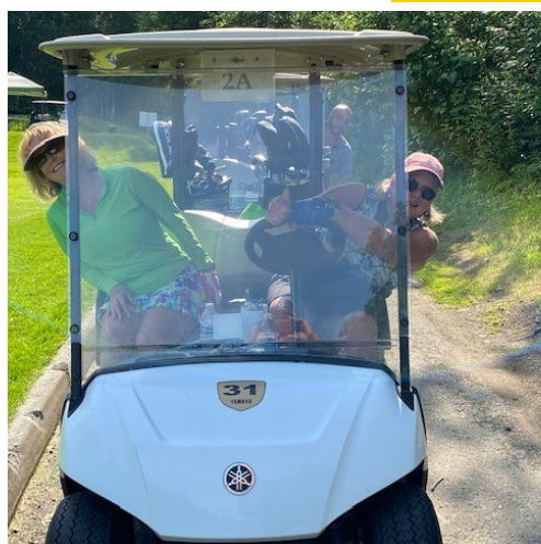
Team Covenant House Alaska