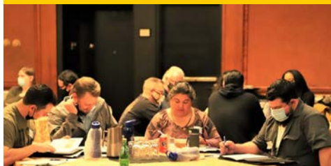
Group work on mock grievance issues

Shop Stewards play a vital role in the representation of our members. A successful Shop Steward must possess a number of traits, including: leadership abilities, good communication skills, and have the ability to put aside their own personal opinions to professionally and objectively represent all of our Teamster-represented members.