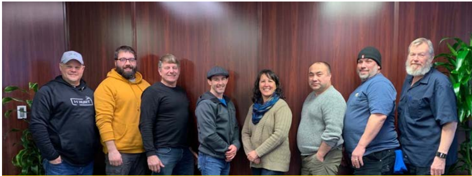
Choctaw Defense Services Negotiation Team