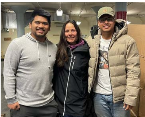
Choctaw Defense Services Shipping & Receiving Crew