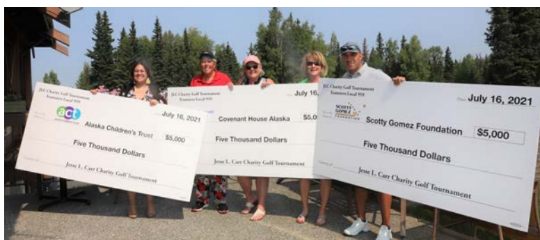
The Alaska Children's Trust, Covenant House Alaska, and The Scotty Gomez Foundation