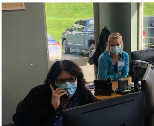
South Peninsula Hospital Infusion Clinic