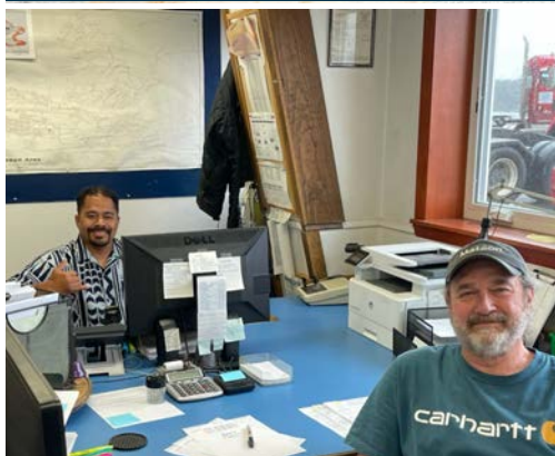
Matson Navigation Kodiak