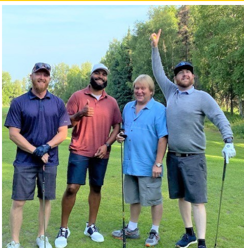
Team Anchorage School District Warehouse