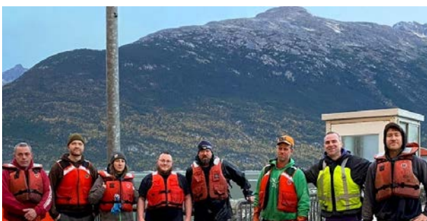
Southeast Stevedoring Corp—Skagway