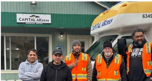
Catholic Community Services—Juneau

It's been a busy winter negotiating contracts, filing grievances, representing our members, and ensuring the managers are adhering to agreements, treating us fairly, and ensuring the workplace is safe. I still have a few more negotiations coming up this spring and summer as well as grievance hearings.