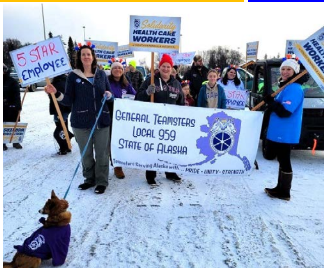
South Peninsula Hospital workers & dedicated others in Homer's 70th Annual Winter Carnival Parade